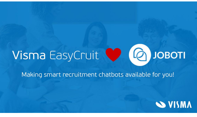
>>> Click here to watch the introduction video

How can you improve the candidate experience in recruitment processes? One solution is to add a virtual recruiter to your team that can help answer frequently asked questions and let candidates easily apply via chat. That is why we are thrilled to announce our partnership with Joboti. Making smart recruitment chatbots available for you.